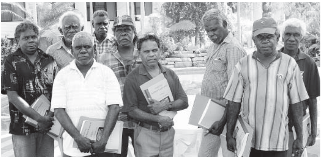
Ngukurr Council members.

The Northern Land Council is part of the portfolio responsibility of the Federal Minister for Immigration and Multicultural and Indigenous Affairs, who throughout the reporting period was the Hon. Philip Ruddock MP.