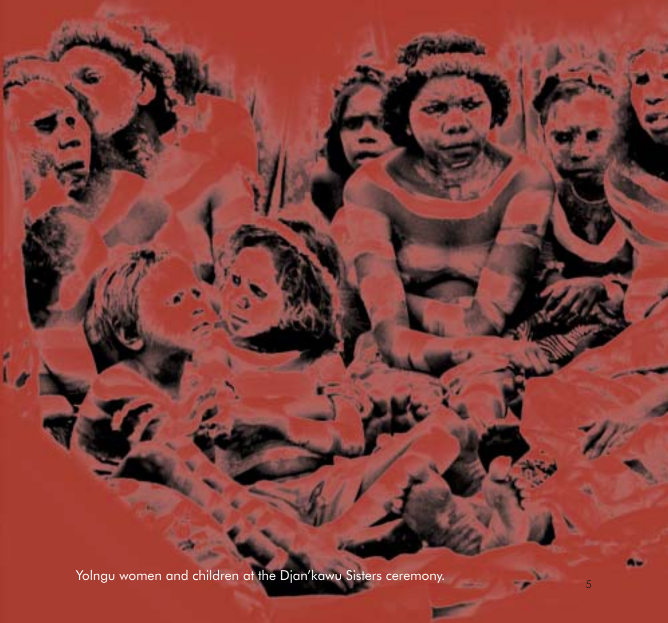
Yolngu women and children at the Djan'kawu Sisters ceremony.