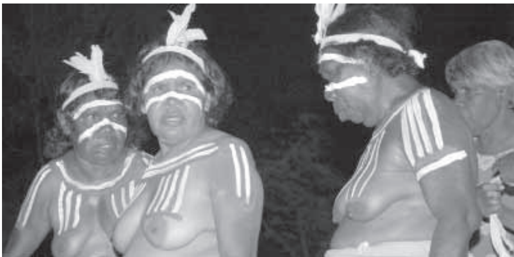
Women dancers at Barunga Festival.

The Northern Land Council is part of the portfolio responsibility of the Federal Minister for Immigration and Multicultural and Indigenous Affairs. The Honourable Philip Ruddock occupied this position until October 2003. The Honorable Amanda Vanstone now heads the portfolio and has done so for the majority of the reporting period.