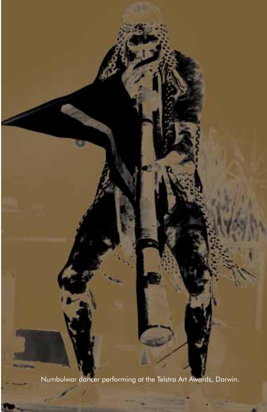
Numbulwar dancer performing at the Telstra Art Awards, Darwin.