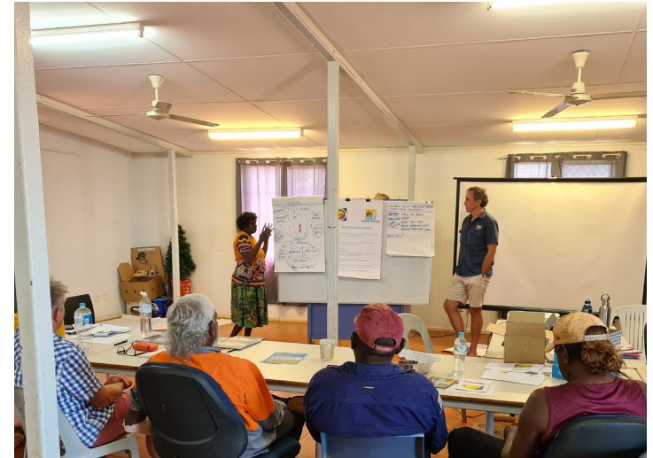
Skilling the next generation in Ngukurr and Numbulwar

The AC believe this project will lessen their dependence on outsiders as it develops the local capacity to organise and run meetings, facilitate decision making about projects and activities, and put in place good planning processes.