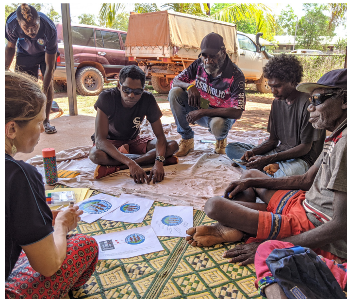
Gapuwiyak Traditional Owners discuss their logo design

The Gapuwiyak Traditional Owners continue to focus strongly on their vision of supporting future generations through the creation of businesses, jobs and training opportunities. In 2019, they completed their first project to set up the Milintji Development Trust. And this year they completed a strategic plan to guide their corporation's direction. Now they are taking the next steps in their plan. Traditional Owners have approved another project with Matrix Consulting and Training to help them strengthen and develop good governance and move forward with their business development. This includes mentoring young people so they can run the corporation in the future and deliver on their vision for the next generations.