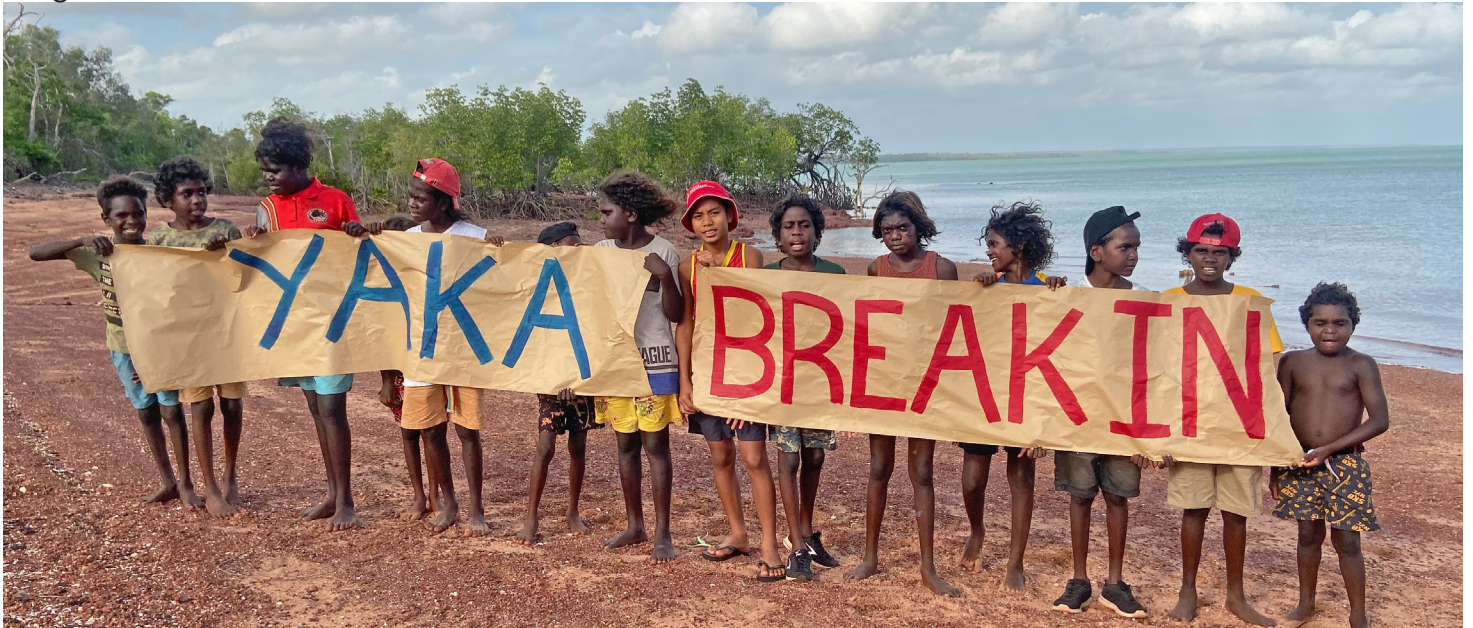
Children participate in youth program funded by Galiwin'ku Traditional Owners