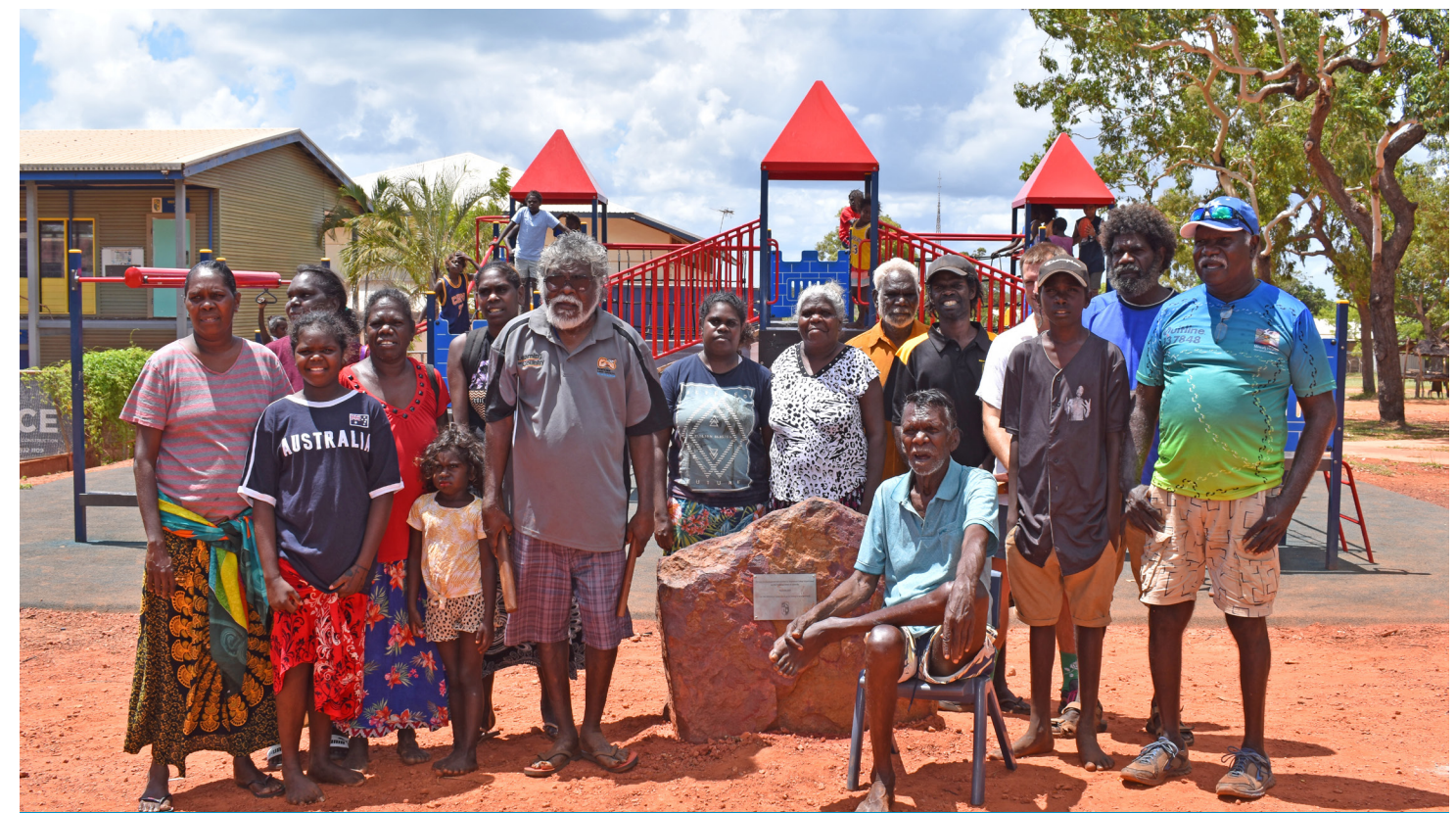
Traditional Owners at Galiwin'ku open the school playground which they jointly funded with Shepherdson College

Galiwin'ku Traditional Owners jointly funded a new playground with Shepherdson College at the Galiwin'ku school. And now the kids are playing on the equipment! It is really "manymak for djamarrkuli", said one Traditional Owner. The playground is a colourful jungle of rope challenges, swinging bridges, monkey bars and double slides! Last week the playground was officially opened. A plaque was put up to acknowledge the great contribution of Traditional Owners to their community. This project meets this group's focus on supporting children and youth in their community. Galiwin'ku Traditional Owners have funded 9 projects in total; the playground is just one way they are supporting their young people to grow up strong and healthy in both Balanda and Yolngu worlds.