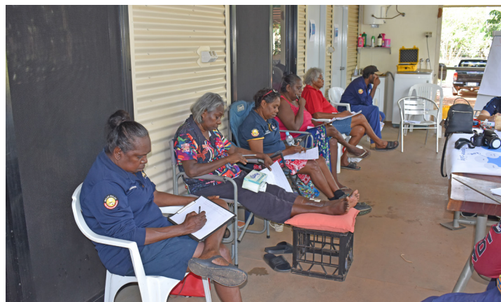
Malak Malak Traditional Owners and Rangers planning projects

Malak Malak traditional owners partnered with the Malak Malak Rangers to fund their third culture camp in September this year. Many people attended, a large number travelling down from Darwin to be on country. The week's events included sharing stories, whittling wooden canoes, boating on the Daly River and eating lots of good tucker! The group are planning to build on the success of this camp next year. Maybe they will even build a full sized canoe as a project challenge!