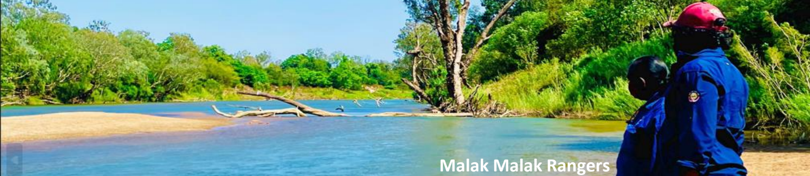
Malak Malak Rangers