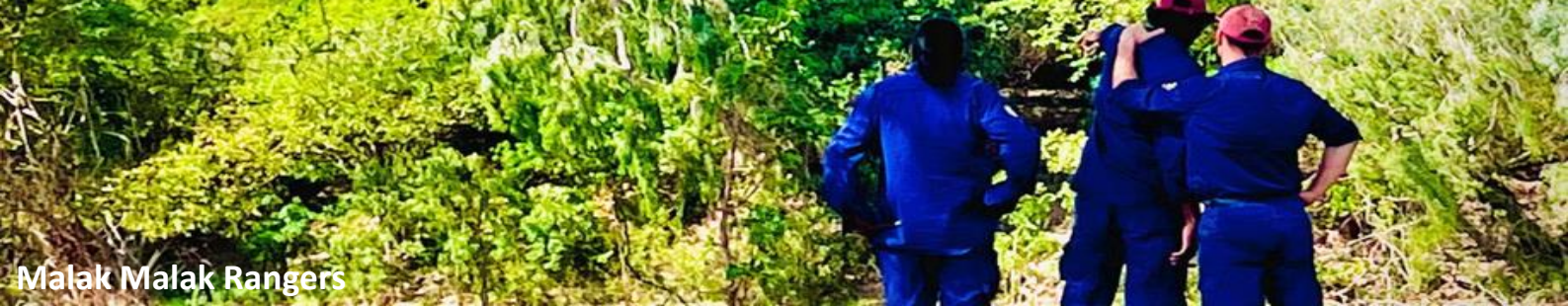
Malak Malak Rangers